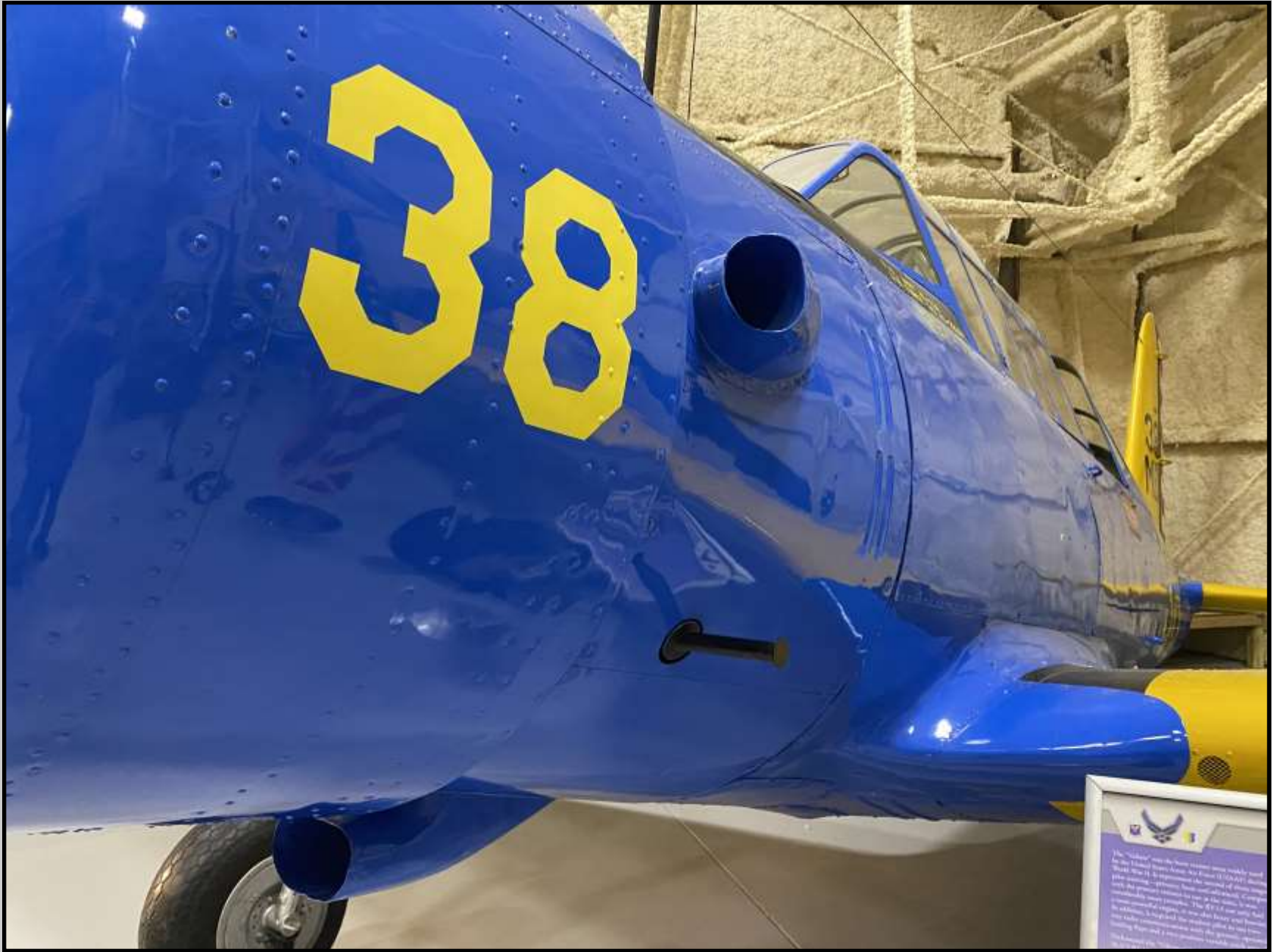
The "Mustang" was the most common single-engine fighter used by the United States Army Air Corps (USAAC) during World War II. It represented the zenith of design and performance for a single-engine fighter, a combination of speed, altitude, and maneuverability that was unmatched. The P-51's most notable contribution was its exceptional range. The P-51's most notable contribution was its exceptional range. The P-51's most notable contribution was its exceptional range.