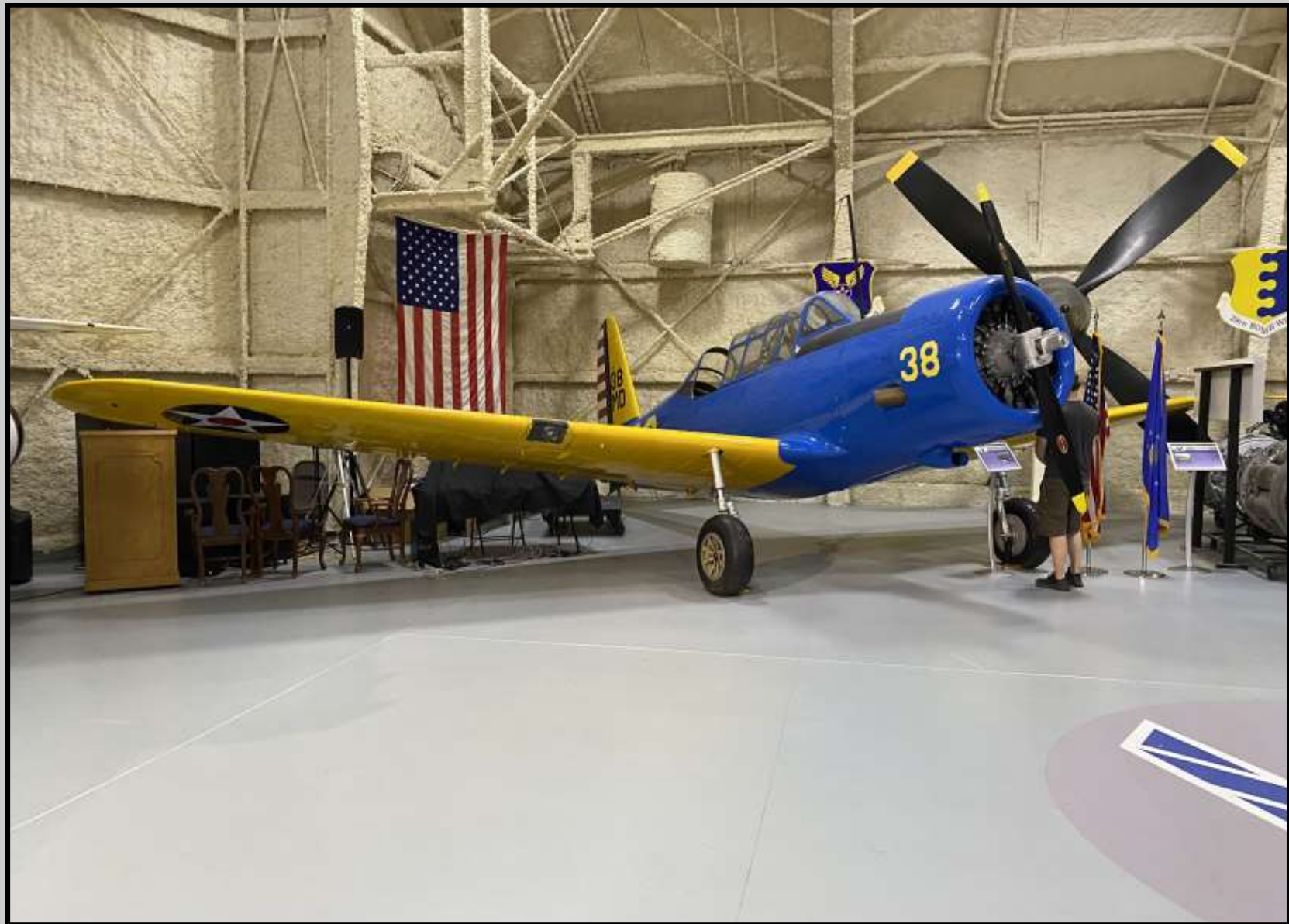
This BT-13A Valiant is located at the South Dakota Air & Space Museum at the entrance to Ellsworth Air Force Base just outside of Rapid City, South Dakota.